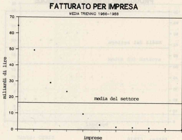
Graf.2: MACCHINE PER MOLINI